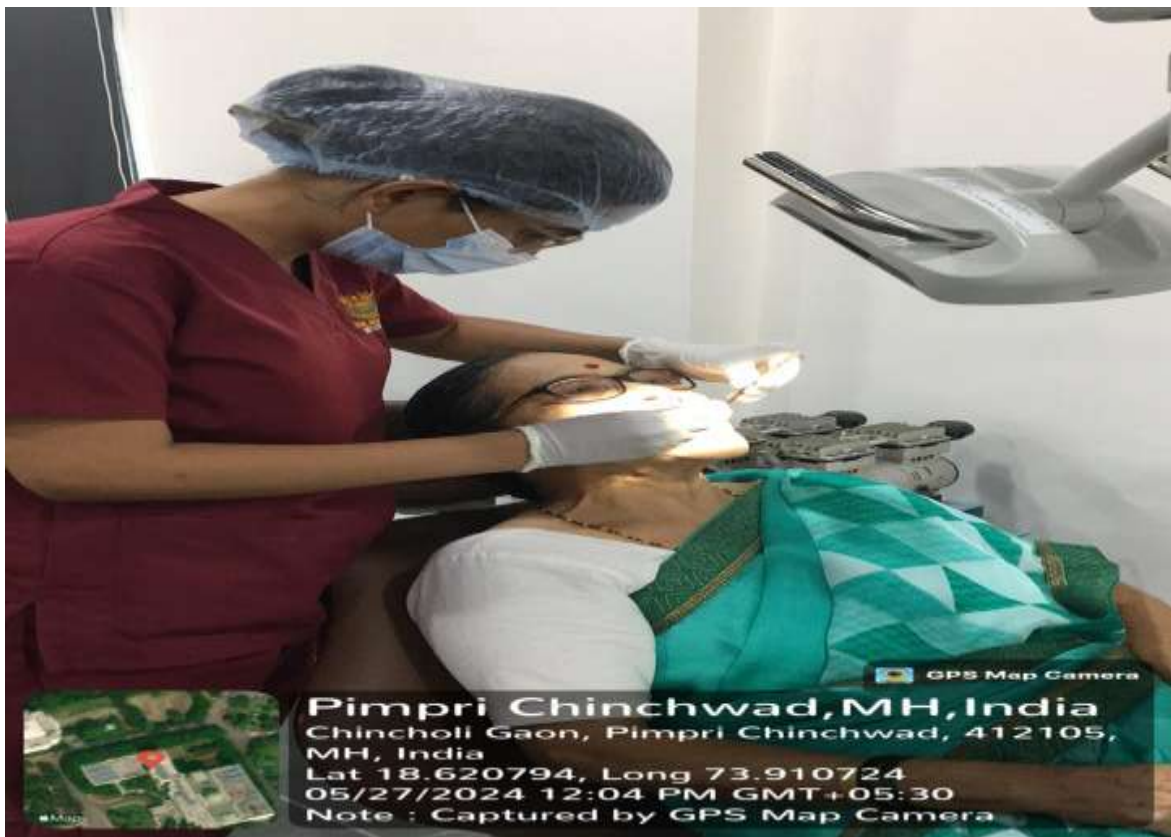
Students training in Geriatric Clinic