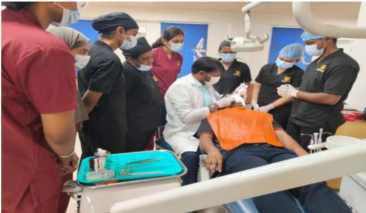
Students training in Aesthetic Clinic in Department of Conservative Dentistry and Endodontic