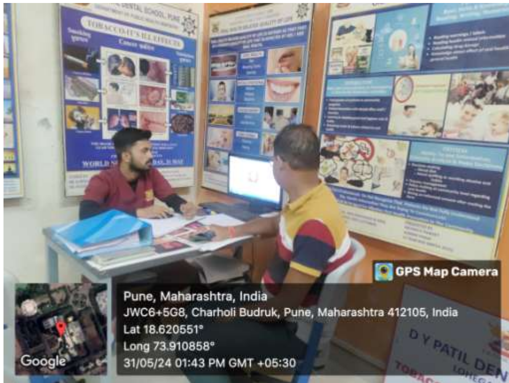
Student Counselling the Tobacco Addicted Patient at TCC